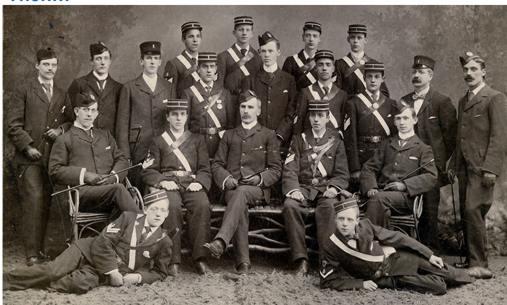
Sir William Alexander Smith and 1 st Glasgow BB Company