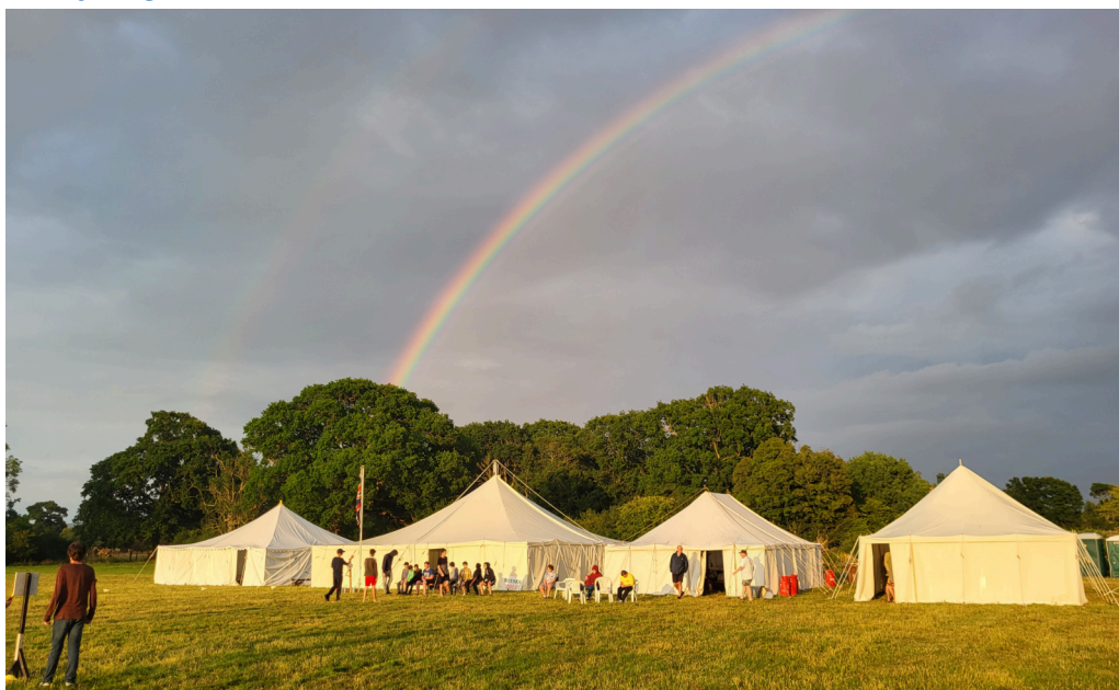
Rainbow Over Glynde B.B. Camp 2022